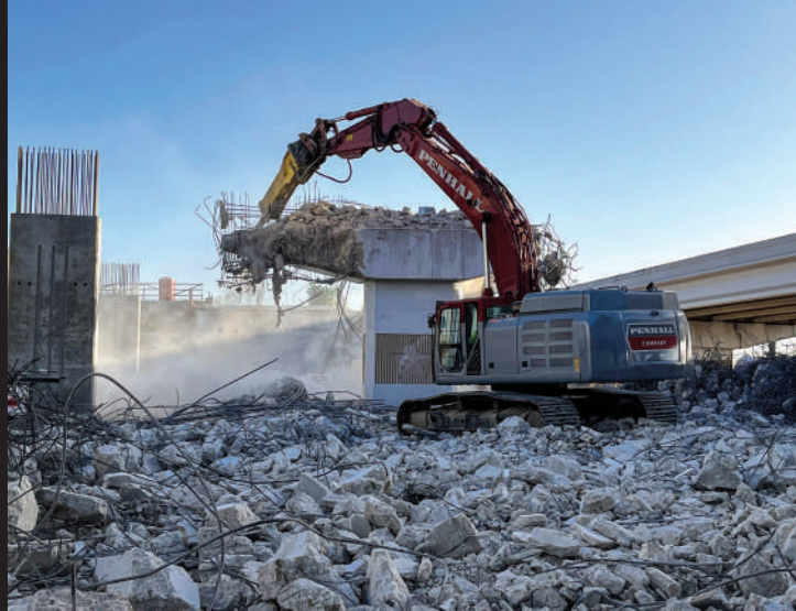
Penhall Co. ( No. 174 ) provided demolition services for the I-2/I-69C Interchange Replacement Project in Pharr, Texas, for the Texas Dept. of Transportation, which involved the removal of 450,000 sq ft of bridge structures.

illustrate the breadth of opportunities available with specialty trades.”